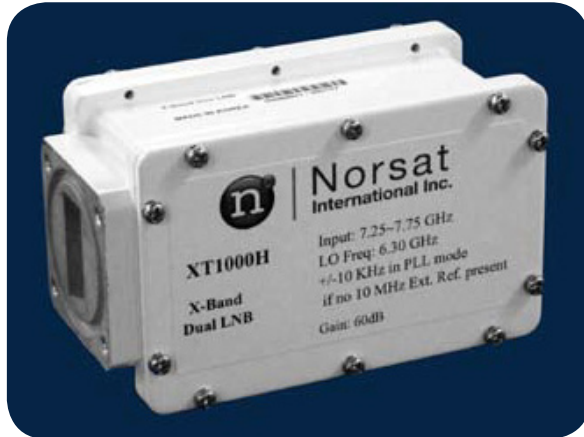
Norsat XT1000H Series