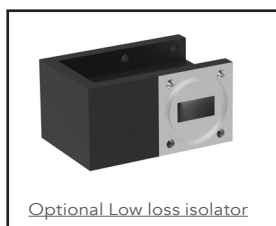
Optional Low loss isolator

All LNA (Low Noise Amplifier) units are individually hand tuned for the very best performance available. Quality and long term reliability is also essential. Therefore all LNA's are tested according to a very extensive test program.